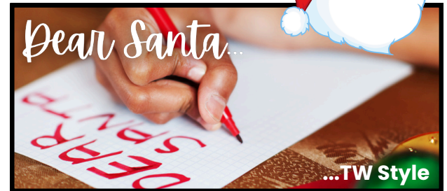
The TOPICS Team asked residents to share their fun, lighthearted 'Dear Santa' wishes....page 6